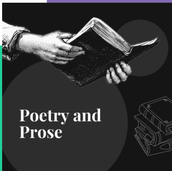
Poetry and Prose