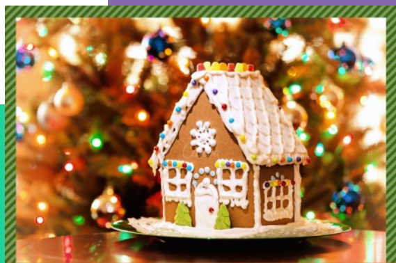
Gingerbread House Decorating - Adults Session